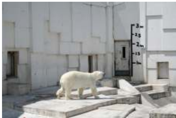
Rara engaged in stereotypic pacing behaviour for long periods of time.

Enclosure 2: Denari engaged in stereotypic behaviour (pacing) for most of the day (from back to front of the cage). A sign in front of his enclosure stated “I get irritated in here because it’s so small but I have to put up with it.”