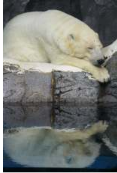
The larger bear was chronically inactive, barely moving throughout the day.

No interaction between the bears was observed and they rested far apart from each other.