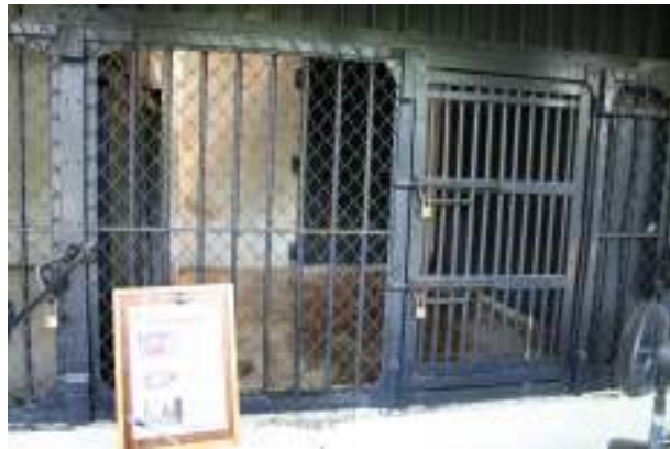
The night dens contained no furniture or soft substrates.

4 night dens behind the cage could be seen. Each night den was approximately 16m 2 in size and had a roof. There was no furniture or no soft substrates in any of the night dens and all had concrete floors. All the night dens were in full view of the visitors.