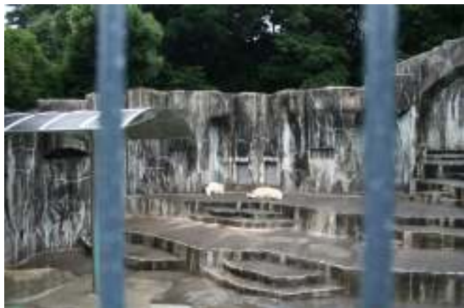
A traditional-style, concrete polar bear enclosure. Such enclosures are now known to be detrimental to the bears' well-being.

In the past, bear enclosures have typically been made of concrete, rock and water, with few, if any, moveable objects. The vast majority of the polar bear enclosures at Japanese facilities embodied this outdated concept. It is now recognised that there is little in such areas that relates to the natural habitat of the animals. Consequently, when polar bears are kept in enclosures of such design, there is little to stimulate their natural behaviour and well-being. 36