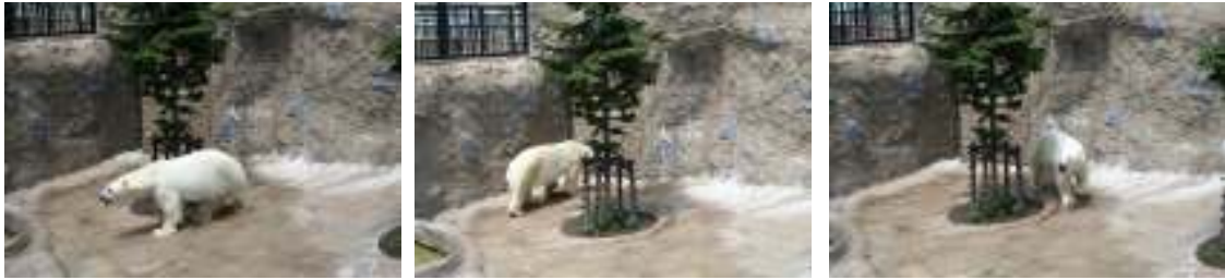
Enclosure 1: The larger bear repeatedly paced a teardrop route around this tree.

The smaller bear was inactive for most of the day, spending the majority of the time resting and sleeping in the pool. If the smaller bear was the female, there was an indication that she had been noted to be inactive before as a sign explained “She (Lulu) has been active since the beginning of the year,” suggesting that before this time she was more inactive.