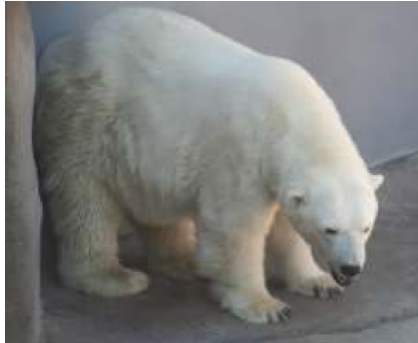
The smaller bear was overweight.

The smaller bear appeared considerably overweight.