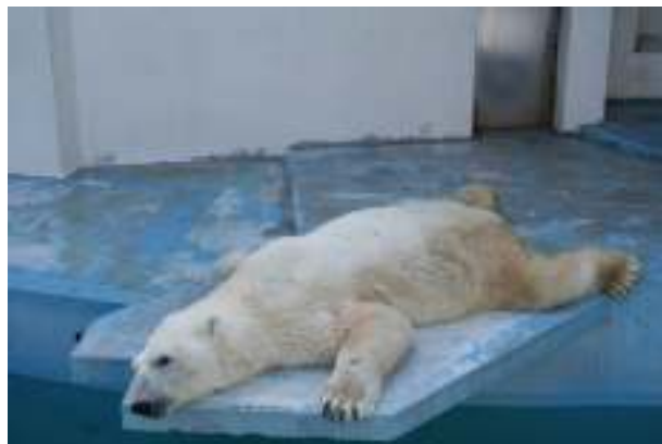
Some bears lay flat on the ground, with their armpits and thighs in contact with the floor, in an attempt to dissipate heat from their bodies.