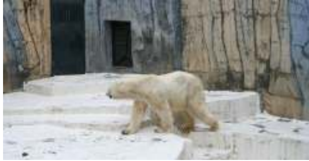
Pinky spent nearly the whole day pacing back and forth.

Pinky engaged in stereotypic behaviour (pacing). Pinky paced more or less continuously for the whole day, always walking the same route back and forth. Each time she started at the same point at one of the walls, then walked 5 or 6 paces, turned and walked back to the same point on the wall. She only stopped once to go in the pool briefly.