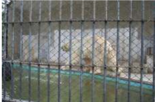
Paul spent many hours pacing along the length of the pool.

Paul engaged in stereotypic behaviour (pacing) for a significant amount of time. The route paced was along the front of the cage and around the pool.