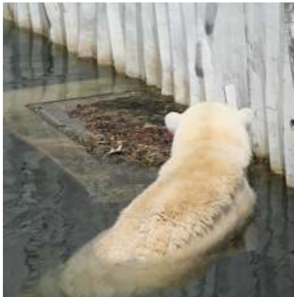
Some pools and moats contained unhygienic water, such as this one at Higashiyama Zoo.

The condition of the water was of particular concern at enclosures at Nihondaira Zoo, Higashiyama Zoo, Kyoto Zoo, Himeji City Zoo and Cuddly Dominion. In addition, the bears at Higashiyama Zoo also had access to a moat at the front of the enclosure which contained filthy, stagnant water. The bears were seen to swim in this water and drink it. There were also drains at the sides of this moat which were filled with rotting leaves and pieces of food. The bears were seen to eat this waste.