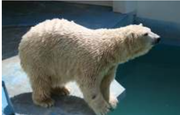
The smaller bear was considerably overweight.

There did not appear to be any obvious outwardly visible signs of physical abnormalities for the larger bear.