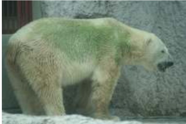
The larger bear had extensive algal growth in the guard hairs.

There did not appear to be any obvious outwardly visible signs of physical abnormalities for the larger bear, although the bear had a significant amount of green fur, indicating algal growth in the guard hairs.