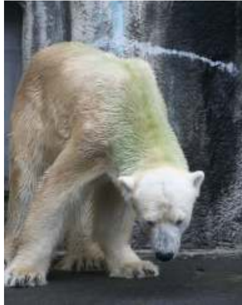
Many bears had green fur, caused by algal growth in the guard hairs. This signifies an inappropriate living environment.

The algae itself does not harm the bear; it is what the algae signifies that is the problem. In captive polar bears in the summer months, the habitat of the hollow hairs suit the algal cells well as it is warm and moist. 54 The rampant algal infestation of the fur of the polar bears is therefore a clear indication that their fur is warm and moist which strongly suggests their bodies are hot and also indicates that their fur is damp for substantial periods of time. The appearance of algae in the hair shaft is therefore indicative of an unsuitable living environment and is also likely to be partly caused by the fact that the bears have no soft substrates that they can use to dry off when they come out of the pools.