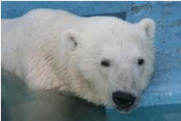
Some bears lay inactive on the land, whilst others lay motionless in pools for hours on end.

Chronic inactivity was exhibited by the 2 bears housed together at Asahi-yama Zoo, the 2 smallest bears at Kushiro Zoo, the largest bear at Yokohama Sea Paradise, the smallest bear at Kobe Oji Zoo, the largest bear at Tokushima Zoo, the largest bear at Tokuyama Zoo and both bears at Cuddly Dominion.