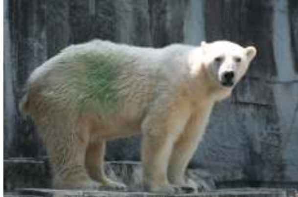
The bear in the main enclosure had algal growth in the guard hairs.

Enclosure 2: The bear was seen to display stereotypic behaviour (neck turning). The bear was also seen repeatedly bobbing up and down in the pool in a repetitive, stereotypic fashion.