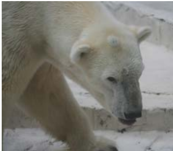
Pinky had a large lump on her head.

Pinky appeared to be underweight and had a lot of loose skin. She had a lump on the top of her head which looked like a tumour or cyst. One side of her mouth looked bigger than the other, possibly indicating a swelling. Her fur was very dirty and matted, especially around her tail. She had patches of green fur indicating algal growth in the guard hairs. She was seen