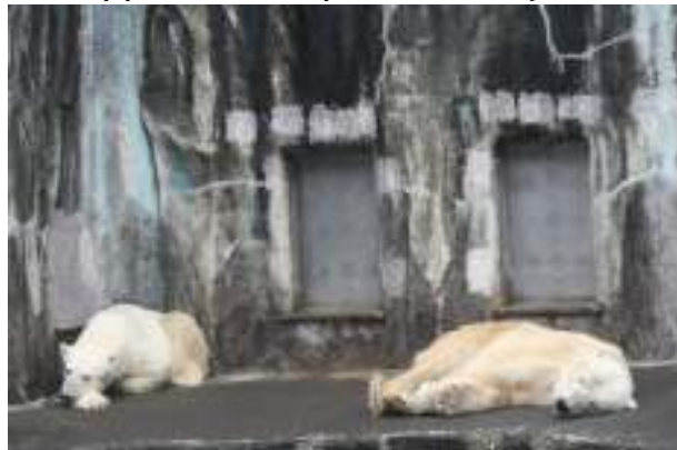
The vast majority of bears had only hard concrete flooring to rest on.

Nearly all of the facilities did not appear to implement any of the recommendations made by various zoo associations and animal welfare organisations in terms of providing natural and soft substrates for the polar bears (Appendix VII).