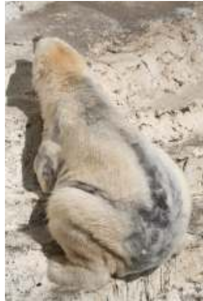
This bear at Hirakawa Zoo exhibited severe fur loss.

In the wild polar bears roll in the snow to groom themselves, but this possibility is not available to polar bears in Japan during the summer months. Therefore dirty fur could be a result of the bears not being able to groom themselves properly. Dirty fur could also be indicative of hygiene problems in the enclosure (outdoor or indoor).