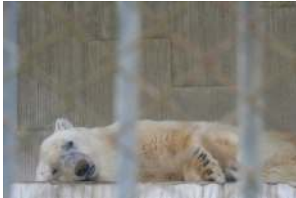
Many bears exhibited long periods of inactivity.

Many of the bears spent a large proportion of their time inactive. This is likely due in part to the extremely hot ambient temperatures that they were exposed to during the course of this investigation. However, the uninteresting living conditions and lack of stimulation was likely to be an important contributing factor too and excessive inactivity in zoo animals is also one of the recognized signs of chronic stress.