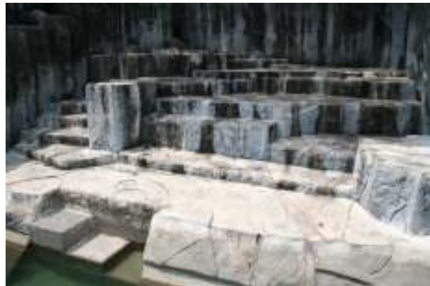
A typical polar bear enclosure, with bare concrete levels supposedly representing a sea-ice environment.

The majority of the polar bear enclosures seemed to be of the style of traditional 1960's-1970's concrete exhibits. Such enclosures are known to damage an animal's mental and physical well-being. 18 The problem with these old designs is that they do not meet the bear's needs on some very basic levels.