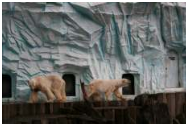
The bears paced the same route simultaneously at the top level of the enclosure.

Both bears utilized only a limited area of the enclosure. No interaction between the bears was observed.