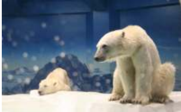
Both bears at Adventureworld were underweight.

The larger bear was substantially underweight and protruding shoulder blades and hip bones were clearly visible. The smaller bear was underweight with prominent hip bones. The smaller bear had bald patches on her head. Both bears had very dirty fur and the smaller bear's fur was heavily matted on one side of her body.