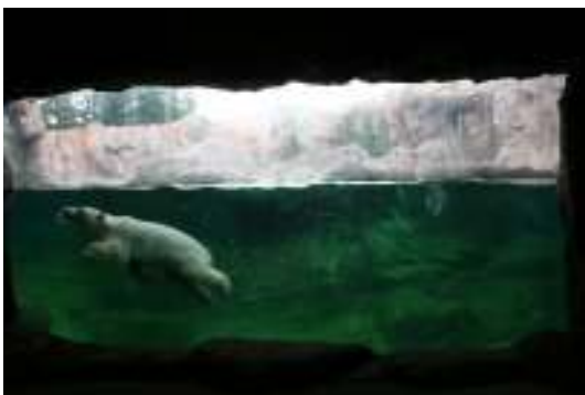
Underwater viewing window at Enclosure 1.

Enclosure 2: The smaller enclosure was open-air extremely small and roughly triangular in shape. It was at visitor level with high walls all around. There was 1 large glass window at the front of the enclosure through which visitors could look into the enclosure from a covered viewing area.