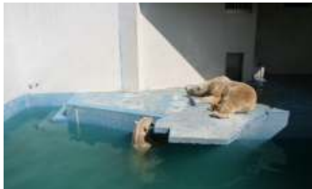
This enclosure at Tokuyama Zoo was exceptionally small with a very limited dry land area, especially for 2 bears.

At all but 3 facilities, enclosure size fell far short of the minimum size requirements of the Polar Bear Protection Act. Generally, the enclosures were too small to allow for the expression of a full range of species-typical behaviours and movements.