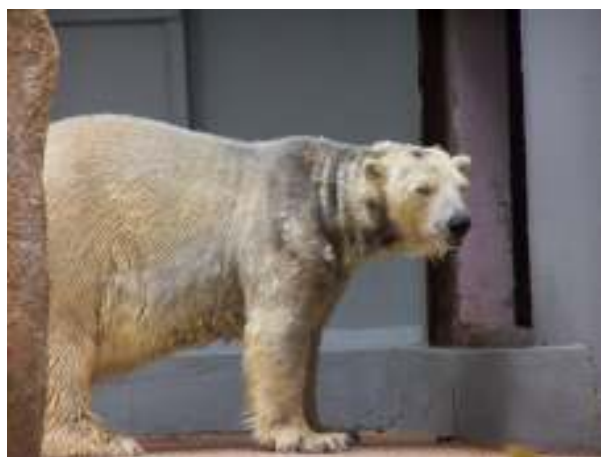
Captive female bear with a classic ‘pear-shaped’ body which is typical for captive bears who have lost a lot of lean muscle mass.

Healthy polar bears carry hundreds of pounds of fat firmly attached to the muscle tissue. However, captive polar bears may exhibit minimal lean body mass i.e. are lacking muscle, which is a common problem in captivity for both males and females. In the wild, healthy adult male polar bears do not have visible necks due to a massive build up of muscle tissue from their shoulders to the base of their heads. In males, insufficient lean body mass can be diagnosed by the obvious appearance of the neck. When a female polar bear with insufficient lean body mass stands up, all of her fat falls down to her hips and she takes on the classic ‘pear shape’ and can be described as a “pear bear”.