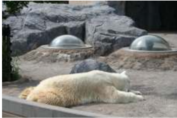
This bear was subjected to intense visitor viewing pressure.

Enclosure 2: No private areas for the bear to escape from public view. Visitors could stand all the way around the front of the enclosure and also at a viewing area at the back. In addition, there was a viewing window at the back of the enclosure. There were also 3 Perspex “viewing domes” inside the enclosure where visitors could put their heads up from below and look into the enclosure. Visitors could do this continuously, resulting in a complete invasion of the bear’s privacy.