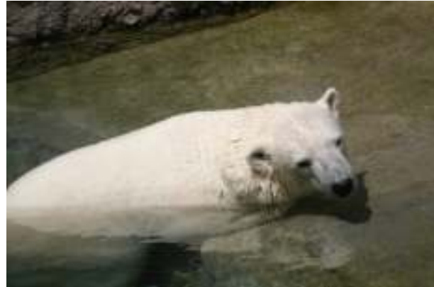
Enclosure 1: The smaller bear spent much of the day lying in the same position in the pool.

The smaller bear was inactive for most of the day, spending the majority of the time resting and sleeping in the pool. If the smaller bear was the female, there was an indication that she had been noted to be inactive before as a sign explained “She (Lulu) has been active since the beginning of the year,” suggesting that before this time she was more inactive.