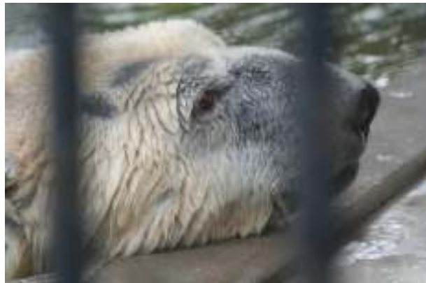
Paul had bald patches on his head.

Paul had bald patches on his head. A sign explained that Paul's teeth were worn down so he was not able to chew well, therefore his meat was minced for him.