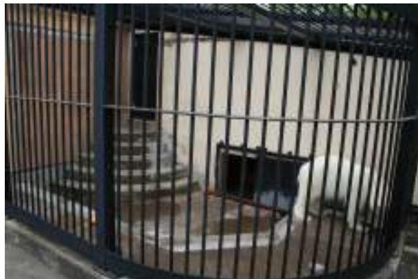
Some enclosures, like this one at Sapporo Muruyama Zoo, were extremely small.

One of the most obvious problems with the vast majority of the polar bear enclosures at Japanese captive facilities was the extremely small amount of space provided for the bears.