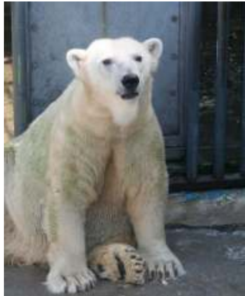
Both bears at Cuddly Dominion were extremely overweight.

The smaller bear seemed stiff and perhaps arthritic in his/her movements as he/she walked. The smaller bear was also observed scratching his/her body a lot with the claws.