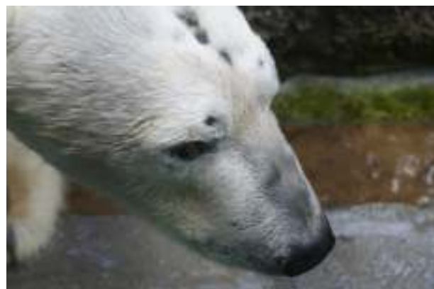
Enclosure 1: The larger bear had bald patches on his head.

Enclosure 1: The larger bear had bald patches on his head and shoulder. A sign referring to the male bear Iwan (probably the larger bear) stated that “the black skin can be seen on the head because he has been active as usual.”