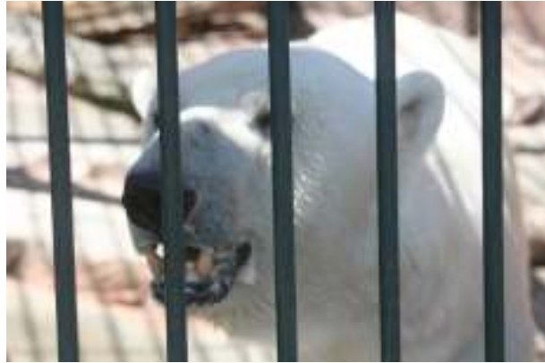
Panting, a method by which bears cool down, was frequently observed.

Polar bears do not have any physiological or morphological means of staying cool (such as sweat glands) and therefore have to rely on behaviour to cool themselves through several unique methods, shared by dogs. 48 One way that polar bears may dissipate heat is through slobbering tongues, panting like a dog. 48 Polar bears will also adopt different postures when sleeping or lying depending on whether they want to get rid of heat or conserve it. 19 The hot spots of bears are the muscles, nose, ears, footpads and particularly the inside of the thighs and “armpits”. Polar bears will lie spread-eagled in their efforts to dissipate heat; their groins and armpits are the only spots on the body that have little fur and no fat. 47 They will lie with their legs (thighs) spread wide to lose heat, often sprawled on snowfields or patches of snow. 48