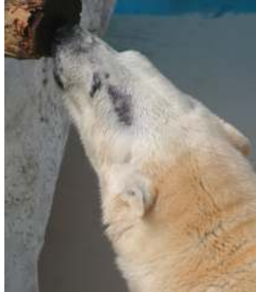
The bear had bald patches on the head.