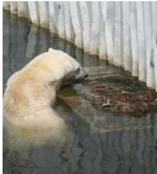
The bears were able to enter the stagnant water in the moat and eat the rotting debris from the drains.

Enclosure floor was clean. However, there were severe hygiene problems with the water in the pool and the moat. The water in the swimming pool was very green and murky, indicating a lot of algal growth. The water in the moat was extremely dirty and dark brown in colour with a lot of algal growth. It appeared to be stagnant and to have not been changed for several weeks. There were drains at the side of this