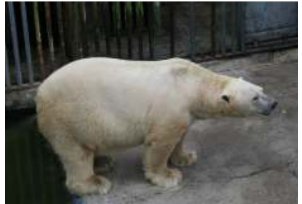
Overweight bear at Cuddly Dominion.

The most overweight bears were individuals were seen at Kushiro Zoo (the two bears housed together), Kobe Oji Zoo (the smaller bear), Tokuyama Zoo (the smaller bear) and Cuddly Dominion (both bears).