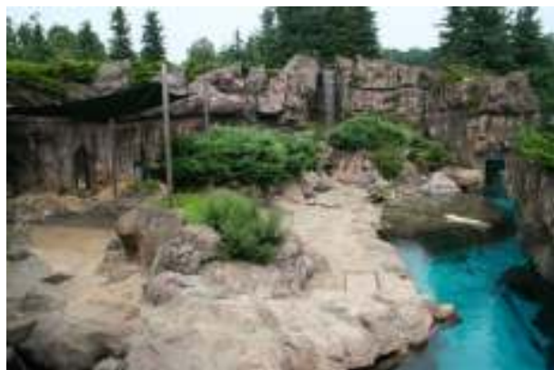
The main enclosure which was on view to the public.