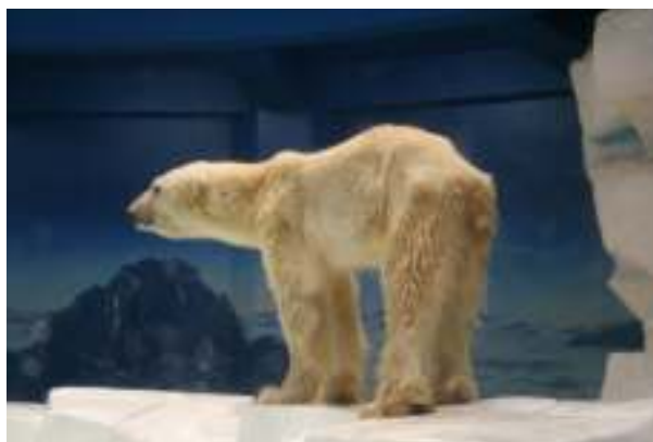
Underweight bear at Adventureworld.

The most severely underweight bears were both the bears at Adventureworld, Pinky the bear at Nihondaira and the larger of the two bears at Hamamatsu Zoo.