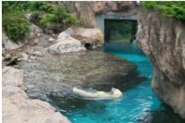
The smaller bear engaged in stereotypic swimming behaviour.

The bear in the main enclosure engaged in stereotypic behaviour (stereotypic swimming)) for a significant amount of time. He/she swam from one side of the pool to the other in a straight line, always pushing off on his/her back from the same position on one side of the pool then, upon reaching the other wall, he/she turned and swam back to the starting position submerged just below the surface of the water. The bear was highly inactive throughout the morning, sleeping on the land and resting in the pool for long periods.