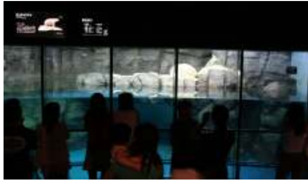
Some bears, like these 2 at Yokohama Sea Paradise, were kept in indoor glass-fronted enclosures.

At 2 facilities, Adventureworld and Yokohama Sea Paradise, the polar bears (2 at each facility) were kept in indoor, fully enclosed, glass fronted enclosures, their only view out being onto an indoor visitor viewing area. These bears lived in completely artificial surroundings, never breathing fresh air or seeing daylight. It is hard to think of a more unnatural situation for this large, wide ranging, Arctic bear.